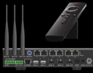
All In One Electronics (External)