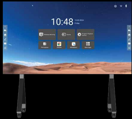
LED Display (Stand or Wall Mounted)

The design concept behind the ATS-Pro All In + One is simple. Use the best Flip Chip COB LED panel on the market today from Taylorleds. Keep the “All in One” electronics for LED processing, HDMI Inputs, Wi-Fi, USB inputs, audio, and operating system with apps and video playback in an external solution from Novastar and add finishing touches like wall mounts, stand and trim.